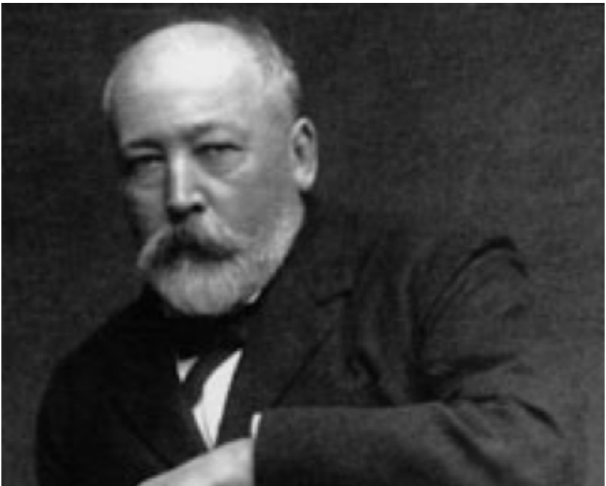
Sir William Cornelius Van Horne.

So to enhance traffic on the CPR, Van Horne envisioned a succession of lavish resort hotels along the railway line through the Rocky and Selkirk Mountains. This hotel opened to the public on June 1, 1888 and was designated a National Historic Site in 1992. From celebrities to heads of state, the beloved Castle in the Rockies is a crown jewel in Banff National Park.