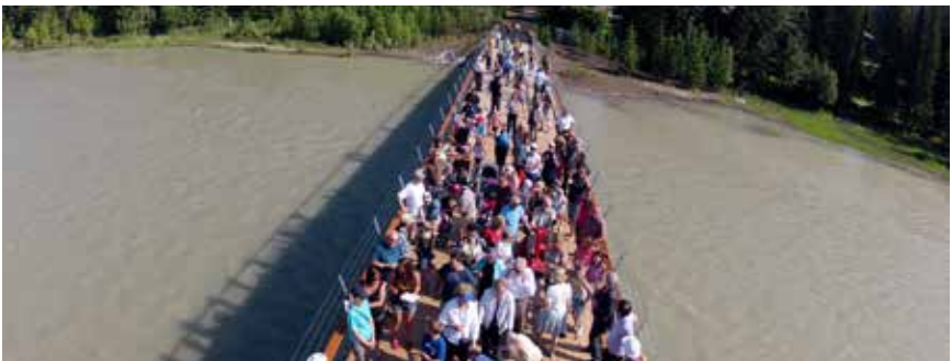
Grand opening, July 2013.

Did you know? In May 2017, morning commuters crossing the bridge were joined by 500+ lb grizzly bear 136, known as Split Lip, who must have decided the bridge would work just fine as a wild-life overpass. Humans backed away, and he made it halfway across before Parks Canada wildlife officers shooed him off the bridge and out of town.