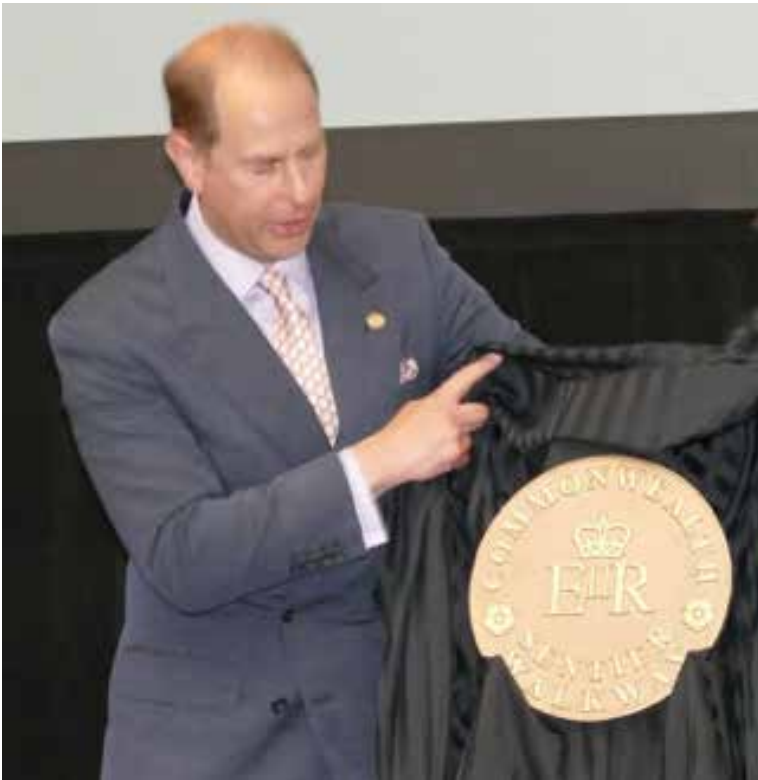
Prince Edward unveiling the Banff Commonwealth Walkway marker, Calgary, 2016.

Did you know? Prince Edward, during a visit to Canada in 2016, suggested that the Banff Commonwealth Walkway also follow a section of the Great Trail.