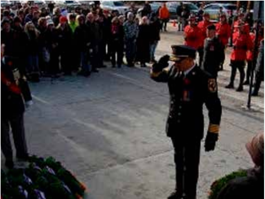
Laying wreaths on Remembrance Day.

The Banff Legion has been a centre of our community since 1918. The Legion was started by veterans for veterans. They knew they needed to come together with their comrades to be united in their shared experience. It is a place and a tradition many of us grew up with. Every November 11th, we stand together at the cenotaph placed by the local IODE on this spot in 1923. The names on that monument represent the families from that time and many of those families and their descendants live in this valley today. It is a place for not just remembering the past, but also for living the present life and looking toward the future. People come here for dances, bingo games, guest speakers, to play a game of pool and to meet some old and new friends for a libation. All are welcome – locals and visitors. Join us in the Banff Royal Canadian Legion #26 Colonel Moore Branch. Come to say hello, bring your story, have a drink, play some pool and take a look around inside at our memorabilia. You are welcome here.