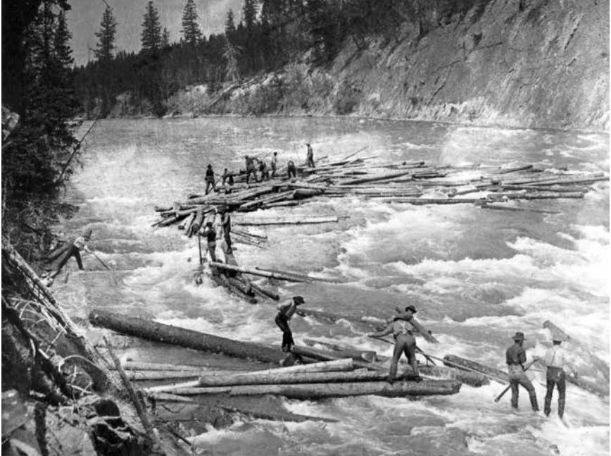
Log run above Bow Falls, ca. 1890.

Did you know? The mining community of Bankhead, at the foot of Cascade Mountain, boasted a domestic electric, water and sewer system years ahead of Banff.