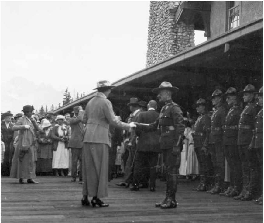
Princess Patricia arriving at Banff Train Station.

The iconic Fairmont Banff Springs has welcomed international heads of state and celebrities for over 125 years. From the Royal Visit of future King George V and Queen Mary in 1901 to Princess Margaret visiting in 1958, the Castle in the Rockies has been a must-visit stop on the itinerary of many prominent guests. Pictured below is Princess Patricia Connaught, the namesake of the Princess Patricia Canadian Light Infantry Regiment (PPCLI), of which she became appointed the Colonel in Chief in 1918. Her father, Prince Arthur, Duke of Connaught was named Governor General of Canada in 1911. The PPCLI serve as Western Canada's local infantry regiment, further demonstrating the longstanding ties in the area with the Commonwealth.