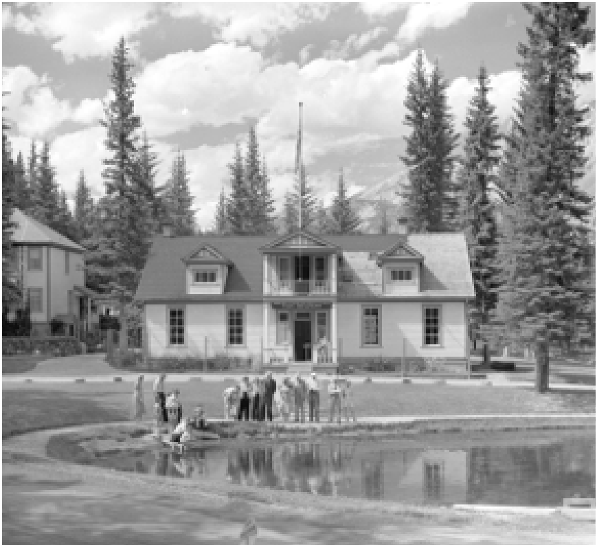
Banff Fish Hatchery 1940.

Did you know? Since 1915, nearly 40 million non-native fish and eggs were released in Banff National Park's watersheds.