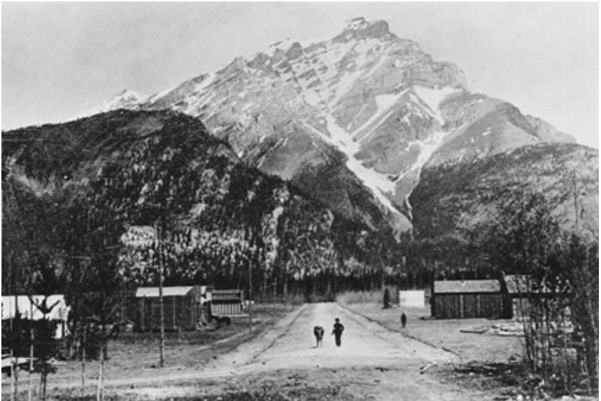
Caption: Banff Avenue ca. 1886. NA 673-27, A.B. Thom, Glenbow Archives.

Did you know? In 1890, the cost of operating Banff National Park was $11,498.38.