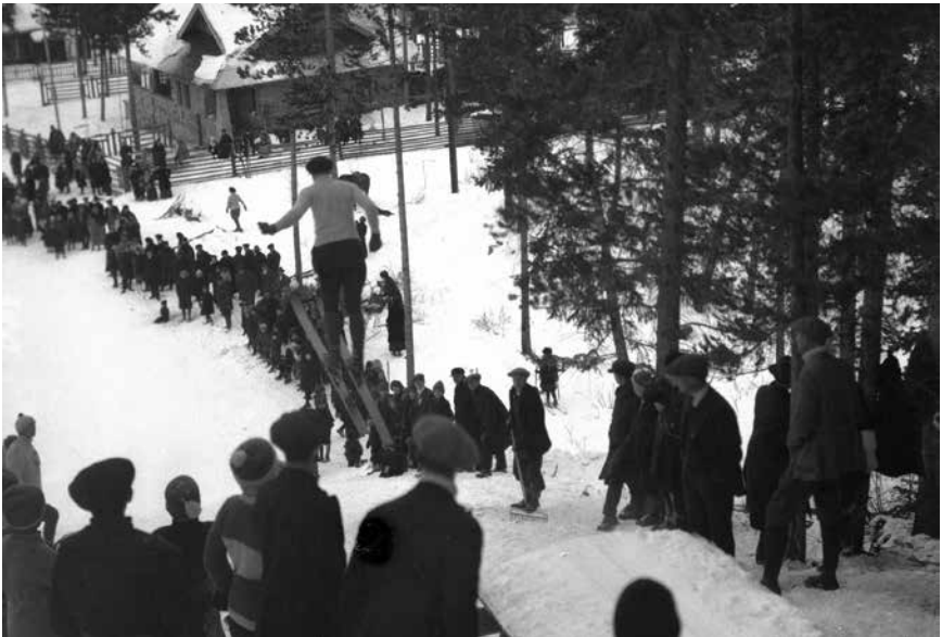
Boys ski jumping on Learn's Hill (Wolverine Street).

Did you know? By 1920, local residents and mountain guides were beginning to explore new slopes in the Bow Valley and in 1927 the Norquay Ski Company Ltd. was created. The era of winter recreation and tourism was now well established.