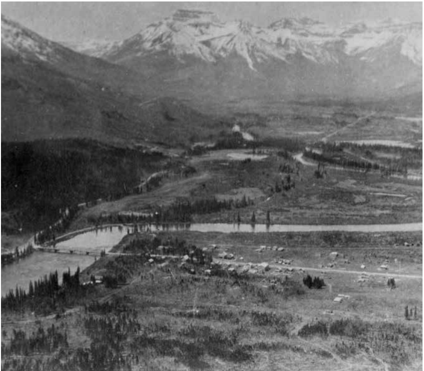
View of Town of Banff from Tunnel Mountain Summit.

Did you know? Tunnel Mountain is also known as Sleeping Buffalo Guardian Mountain “Eyarhey Tatanga Woweyahgey Wakân”, its Stoney Nakoda name. The early surveyors for the Canadian Pacific Railway thought they would have to tunnel through the mountain. Instead, the railway goes around it.