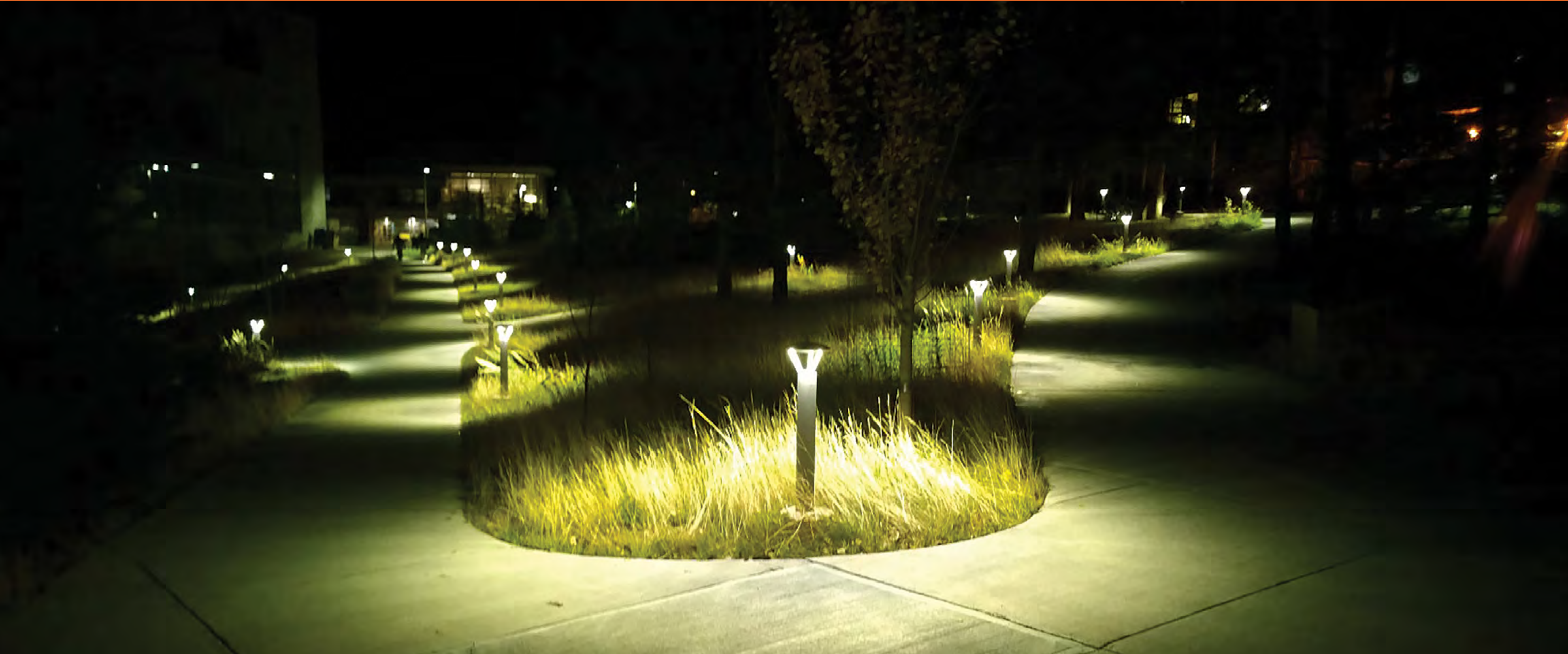
What trail lighting might look like (Banff Centre campus, low level, capped bollards)