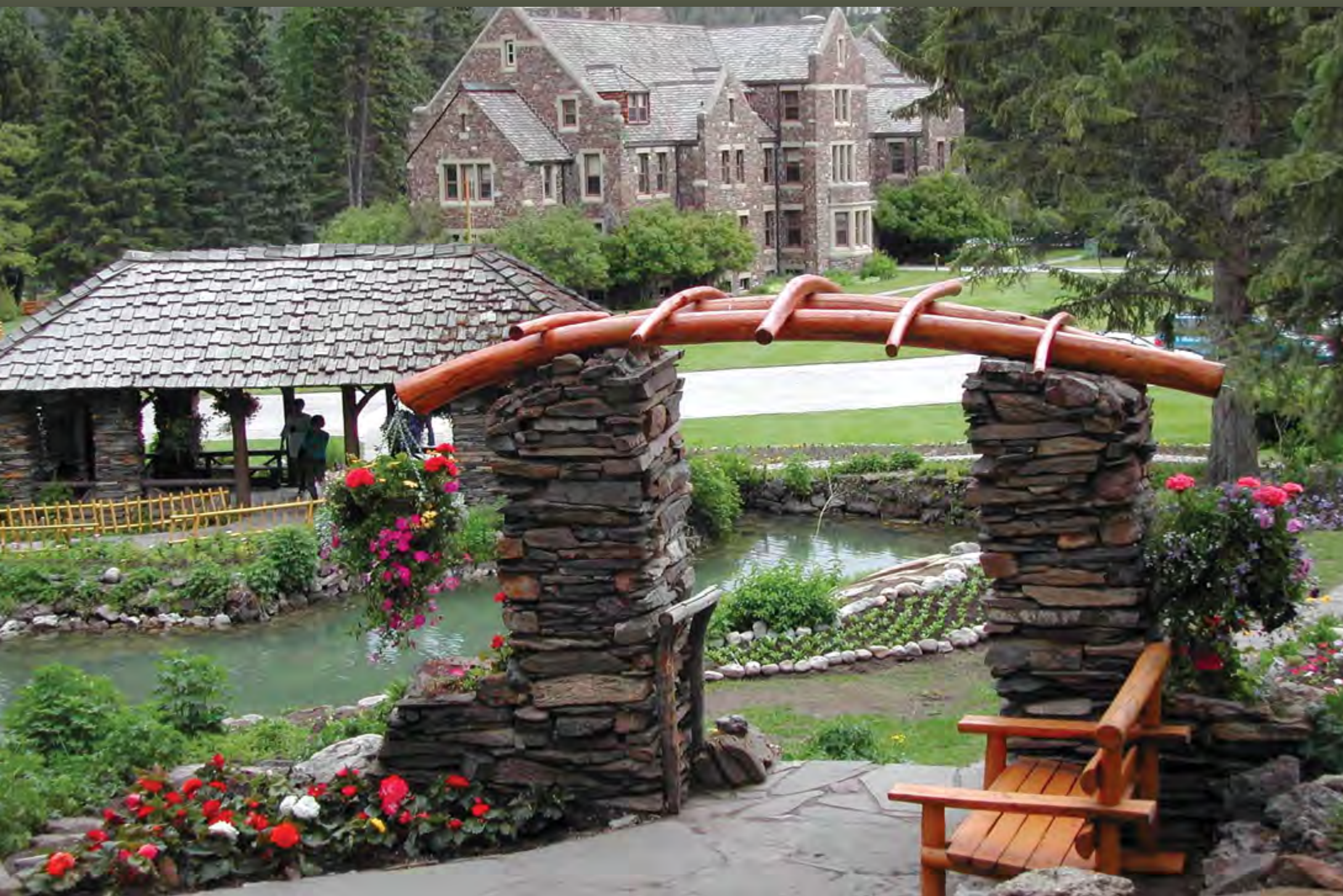
Parks Canada Administration Building, Cascade Gardens

PROTECTING, PRESERVING AND PROMOTING BANFF'S BUILT HISTORY