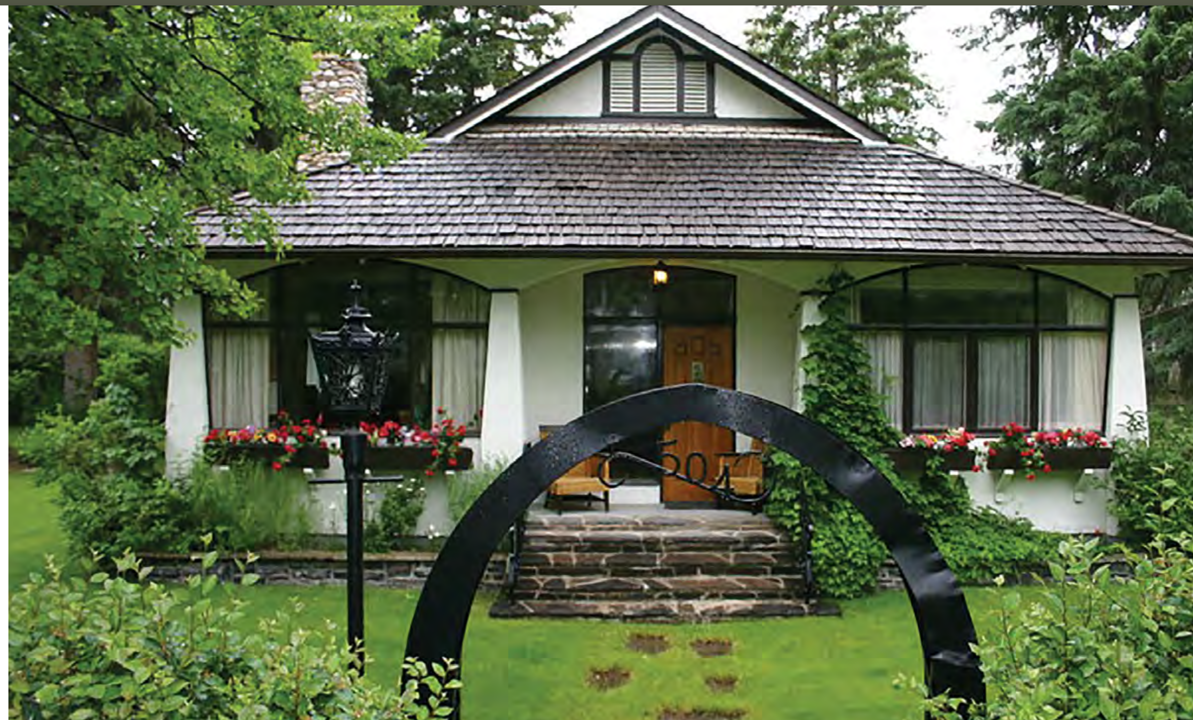
504 Buffalo St. Recognized Historical Resource (undesigned)

As part of the Canadian Rocky Mountain Parks UNESCO World Heritage Site, Banff strives to protect and preserve the Town's built and natural heritage. In 1996, Council established a municipally owned not-for-profit Heritage Corporation. The Town of Banff Heritage Corporation is able to receive endowments, property grants, and other forms of donations from the public, businesses, other levels of government, or agencies such as the Alberta Historical Resources Foundation.